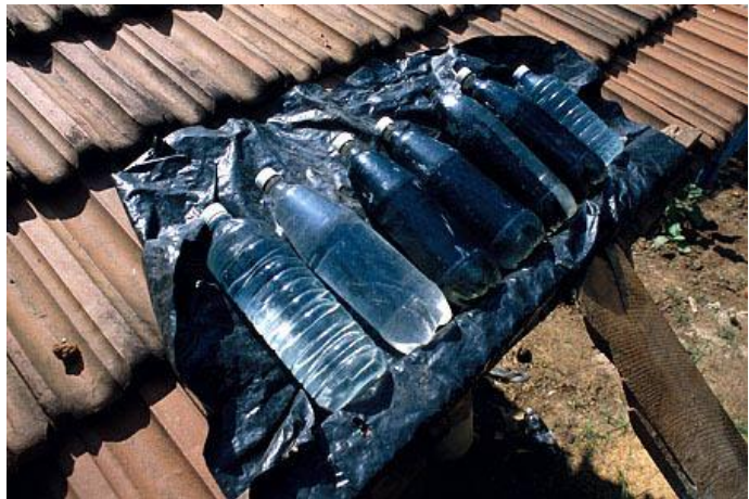
Figure 2: Bottles are left for the day.

SODIS is a simple, low-cost and easily replicable solution to clean drinking water. SODIS works through a combination of heat and pathogen-killing Ultra Violet radiation (both through sunlight). For this method to work well, the exposure to sunlight should be at least six hours, or until the water reaches a temperature of 55°C.