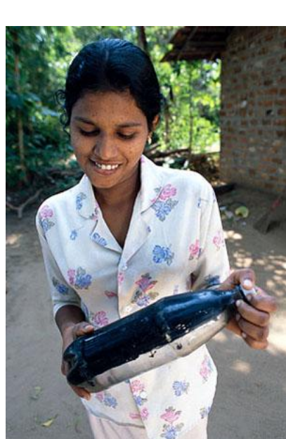
Figure 3: The back face of the bottle can be painted black to help absorb solar energy thus heating the water.